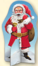
1 "Santa Claus" cardboard standup