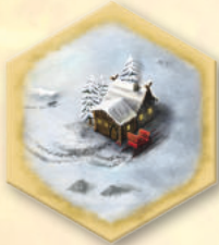
1 "Home of Santa Claus" special hex